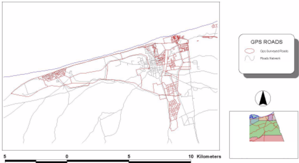
Map 2: Surveying roads network in the city using GPS

Finally, another step was undertaken namely of overlaying the previous 2 sets of layers with a satellite image of the area. The resulting image provided an excellent overview of the complete road network and the existing land use in the area being surveyed (compare map 3).