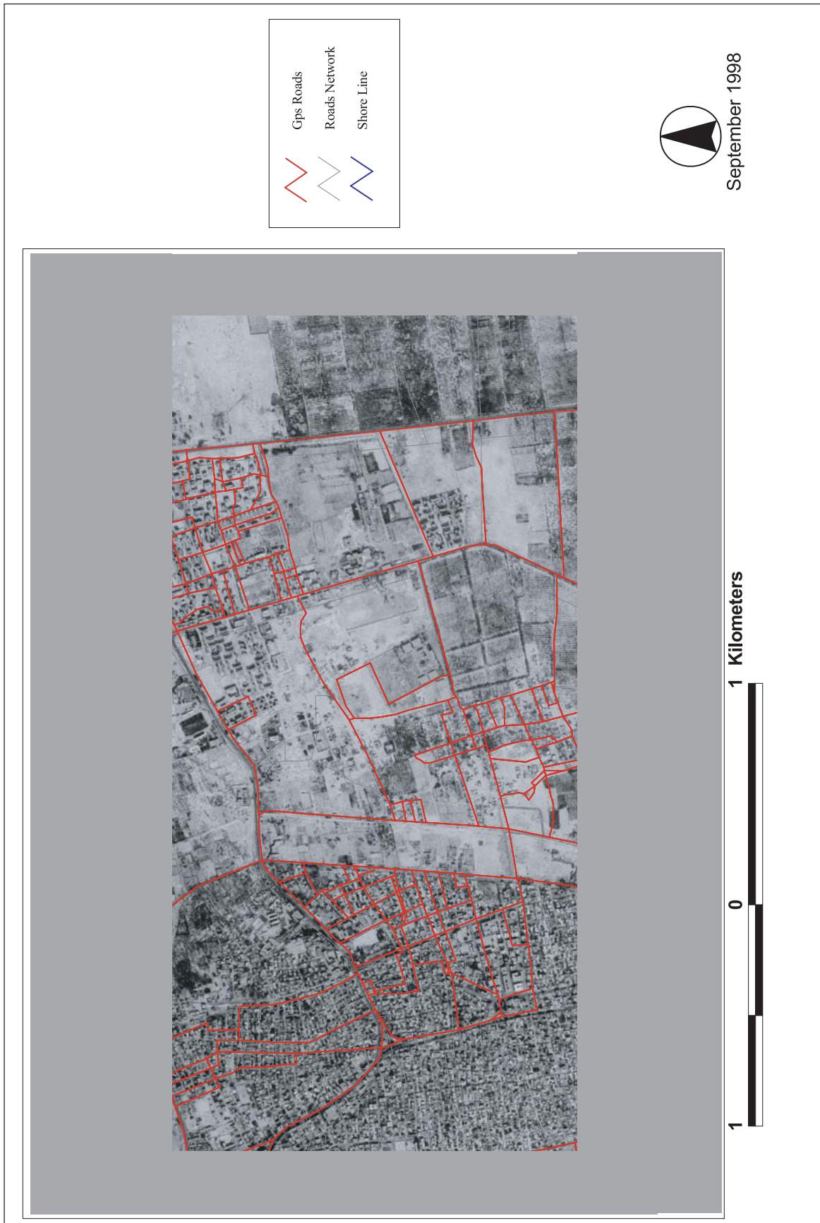
Map 3: Updated Road Network in the city after the GPS survey