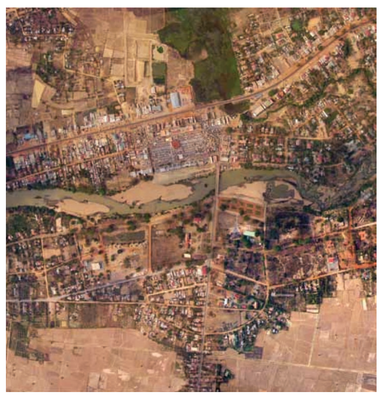
Photo 9: After georeferencing, mosaicing and post processing, all photos will be merged to a large, high resolution orthophoto*

Finally the Department of Land Management produced a map based on the aerial photo, in order to discuss plans for the future development of the town.